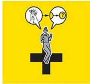
ACKNOWLEDGE THE FIRST RESPONSE