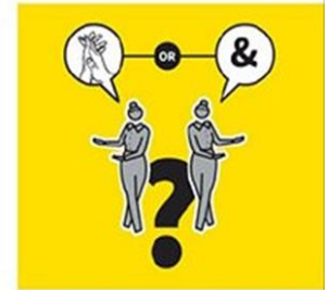
RESPOND TO THE IMPROVED RESPONSE