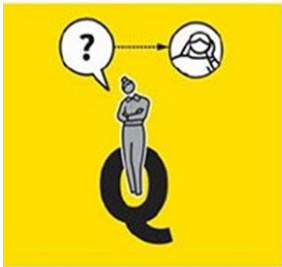
ASK A STUDENT A QUESTION