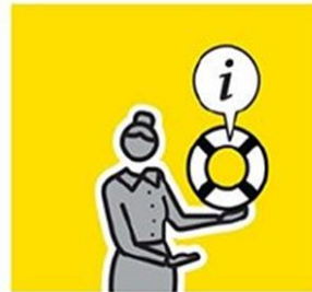
GIVE SUPPORTIVE FORMATIVE FEEDBACK