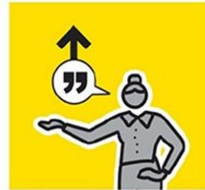
INVITE STUDENT TO "SAY IT AGAIN BETTER"