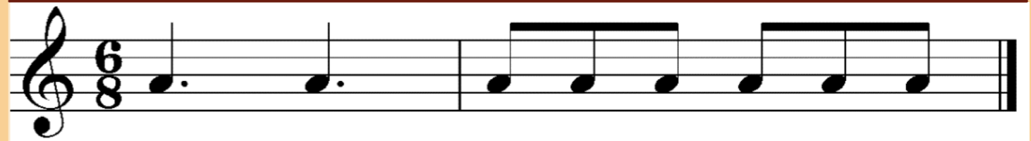
Two dotted crotchet beats per bar: compound duple