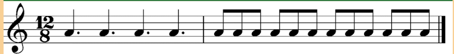
Four dotted crotchet beats per bar: compound quadruple