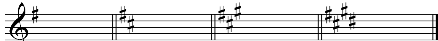
G Major D Major A Major E Major