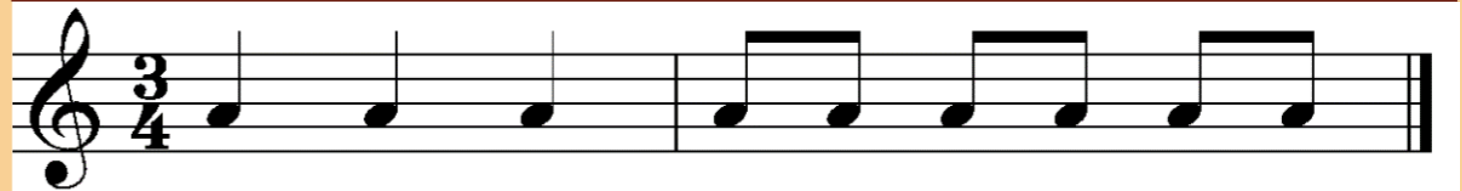
Three crotchet beats per bar: simple triple