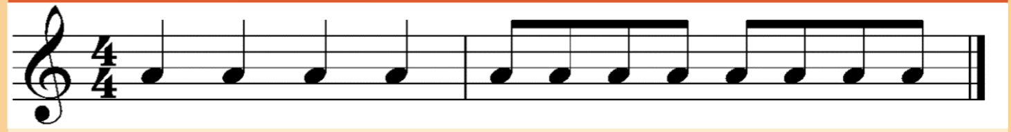
Four crotchet beats per bar: simple quadruple