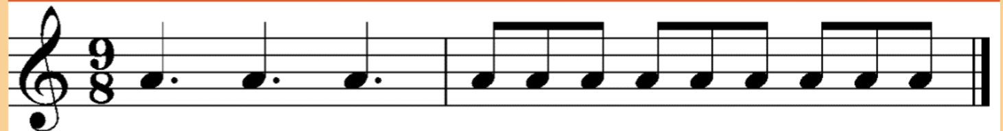
Three dotted crotchet beats per bar: compound triple