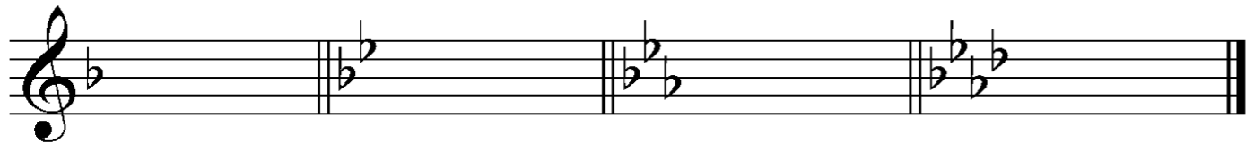
F Major Bb Major Eb Major Ab Major