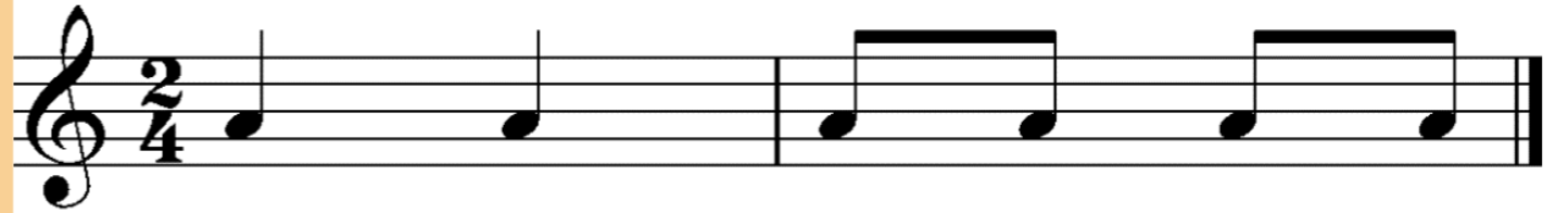
Two crotchet beats per bar: simple duple